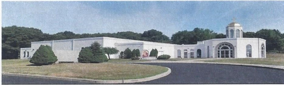
Melkite Greek Catholic Church 15 Skyview Drive, Lincoln, RI 02865 Visit us on the web: www.stbasilthegreatchurch.com

Rectory 111 Cross Street Central Falls, RI 02863