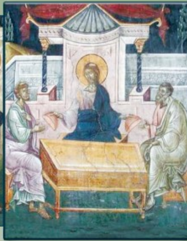
The Emmaus Experience (Luke 24:13-35)