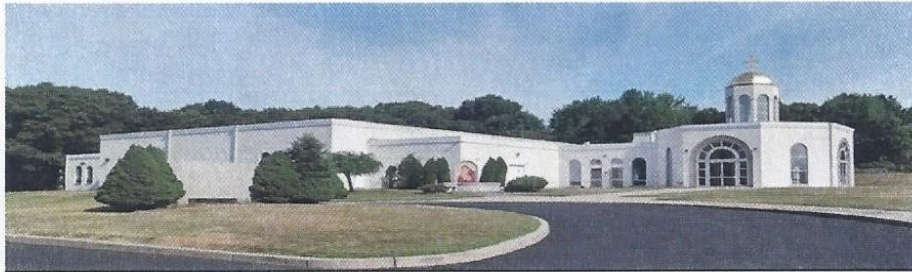
Melkite Greek Catholic Church 15 Skyview Drive, Lincoln, RI 02865 Visit us on the web: www.stbasilthegreatchurch.com

Rectory 111 Cross Street Central Falls, RI 02863