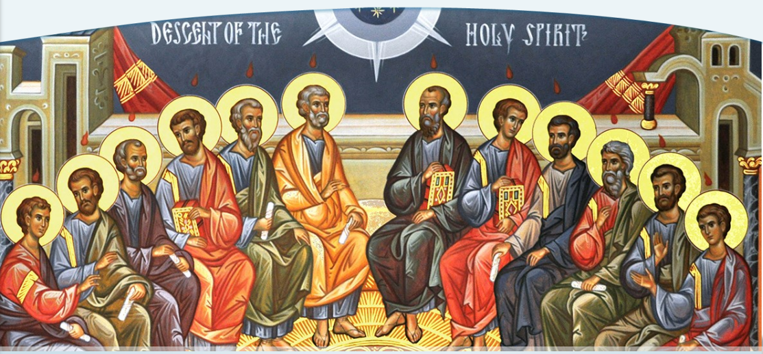
أحد العنصرة HOLY AND GLORIOUS PENTECOST SUNDAY