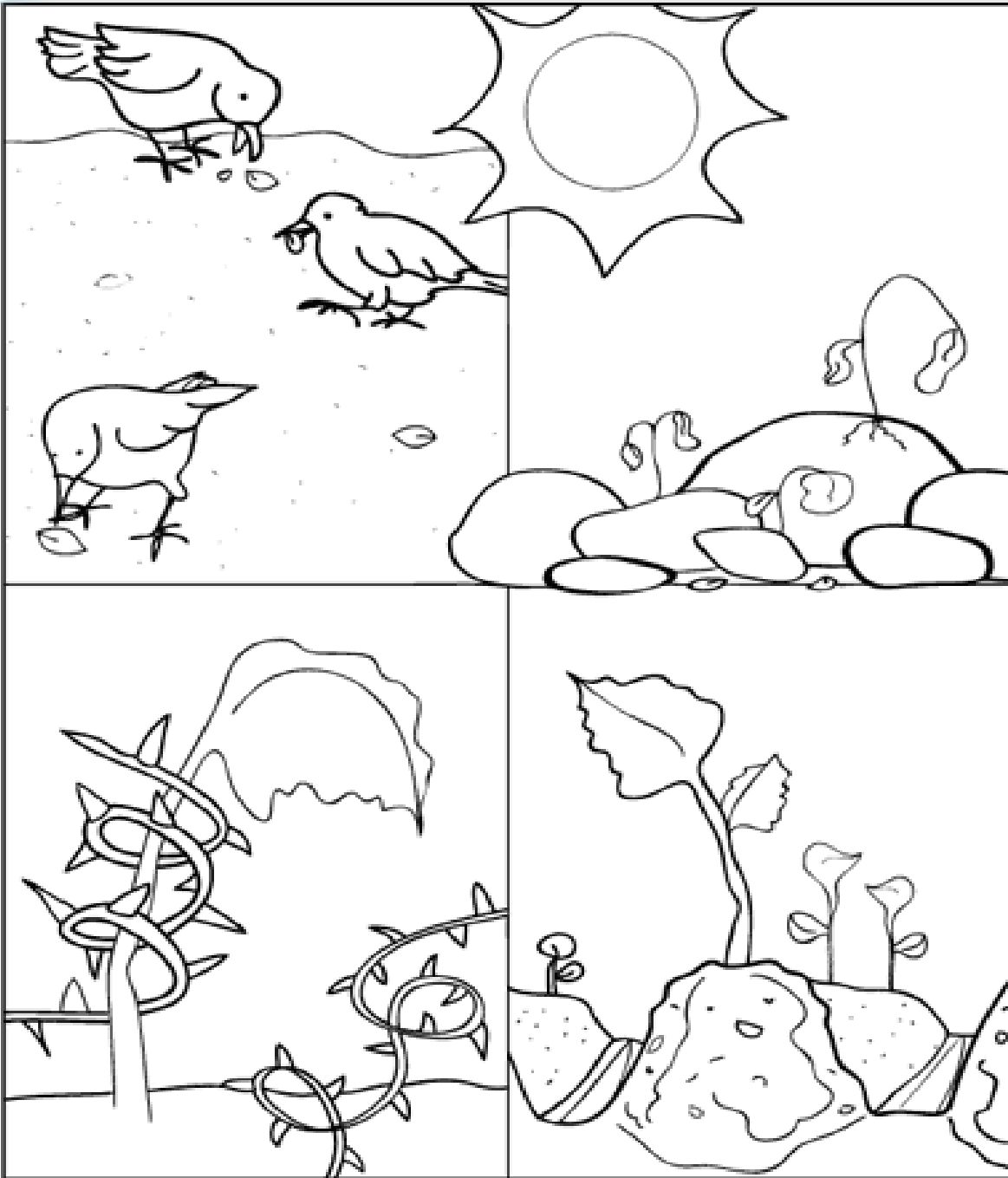
The Parable of The Sower and the Seed

Copyright © 2011, BibleWise. All Rights Reserved. Drawing by Kathryn Wojno .