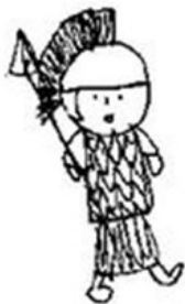
The centurion went home.