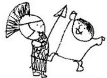
His servant was well!