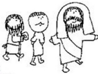
Jesus went to Capernaum.

I am not worthy that you should come under my roof; but only say the word, and my servant will be healed