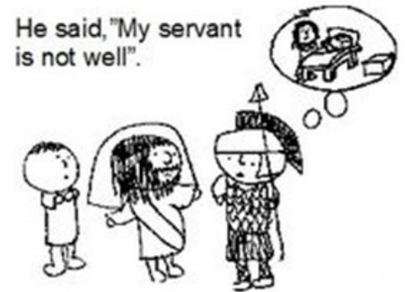
He said, "My servant is not well".