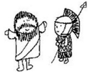
Jesus said, "Go home".