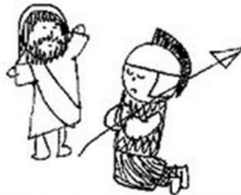
A centurion came and asked for help.